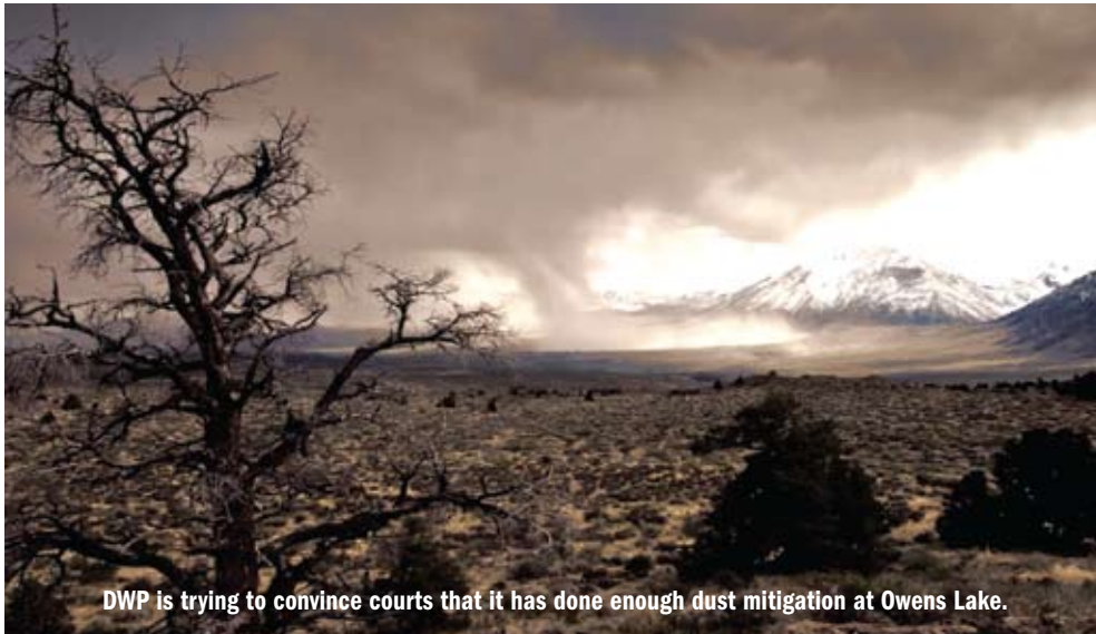
DWP is trying to convince courts that it has done enough dust mitigation at Owens Lake.

The OVC also wrestles with dying meadows and