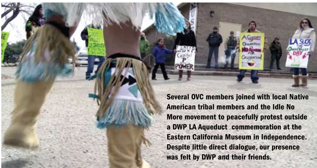
Several OVC members joined with local Native American tribal members and the Idle No More movement to peacefully protest outside a DWP LA Aqueduct commemoration at the Eastern California Museum in Independence. Despite little direct dialogue, our presence was felt by DWP and their friends.

Please consider a tax-deductible donation before June 30 to assist us in meeting our current $19,000 goal for matching funds. Your support helps us to be a strong voice for water solutions that are beneficial for the people, plants and animals throughout the beautiful Owens Valley. OVC can receive funds through checks in the enclosed envelope or by donating on the OVC website, ovcweb.org or the Indiegogo Slake campaign website (see page 1).